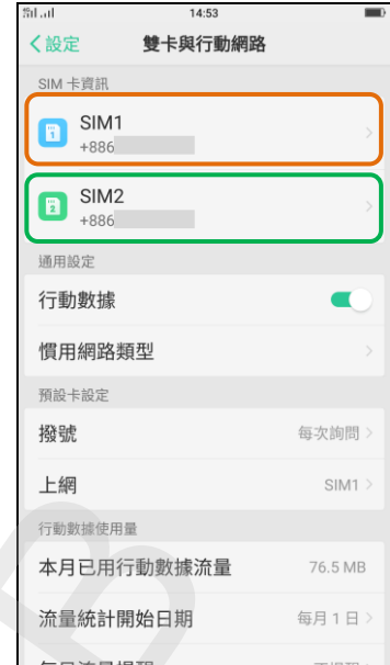
3.選擇 SIM1 /SIM2